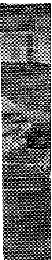
One of the